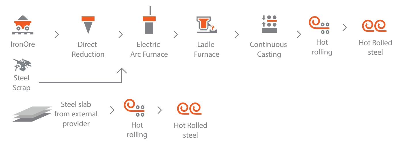
Figure. 1. Flow diagram of hot rolled steel manufacturing process